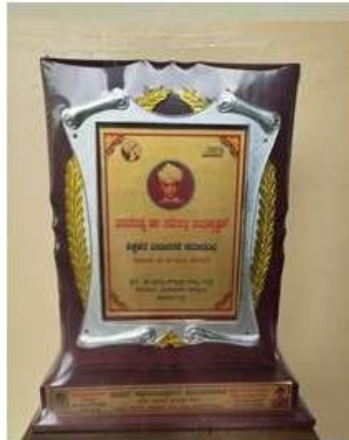
Award for conduct of Medical Camp on Teachers day, Koladevi Village, Mulbagal Taluk, Kolar District on 05.9.2015, in appreciation for the involvement of Teachers and students of the constituent Medical Collegee

Director Department of Research and Innovation Sri Devaraj Urs Academy of Higher Education & Research Tumaka, Kolar, Karnataka-563103