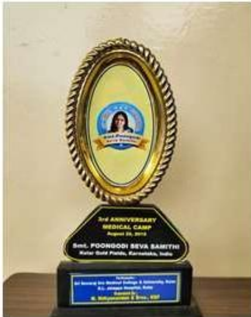
Award for conduct of medical camp held on 22.08.2015 in KGF, Kolar from Smt Poongodi Seva Samithi, KGF,Kolar