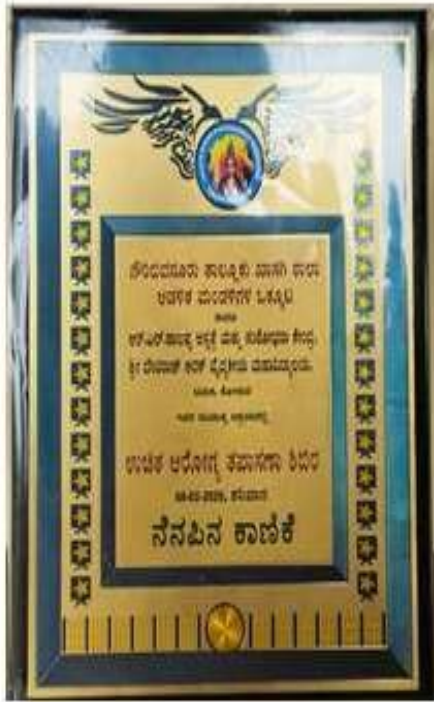
Award for conduct of Free health camp in Gauribidanur Taluk School on 08.02.2020 from Gauribidanur Takuk private school Organisation