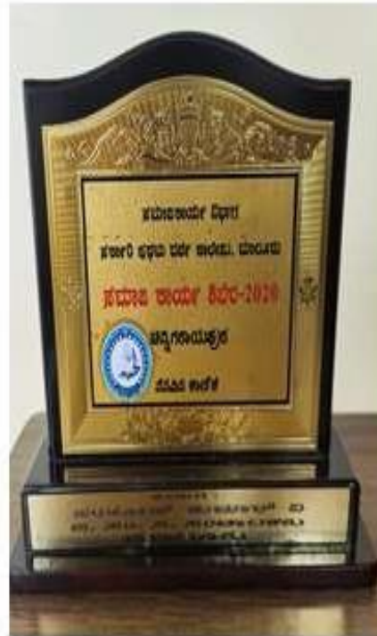
Award for conduct of camp 2020 in Channigarayapura, Kolar

Director Department of Research and Innovation Sri Devaraj Urs Academy of Higher Education & Research Tumaka, Kolar, Karnataka-563103